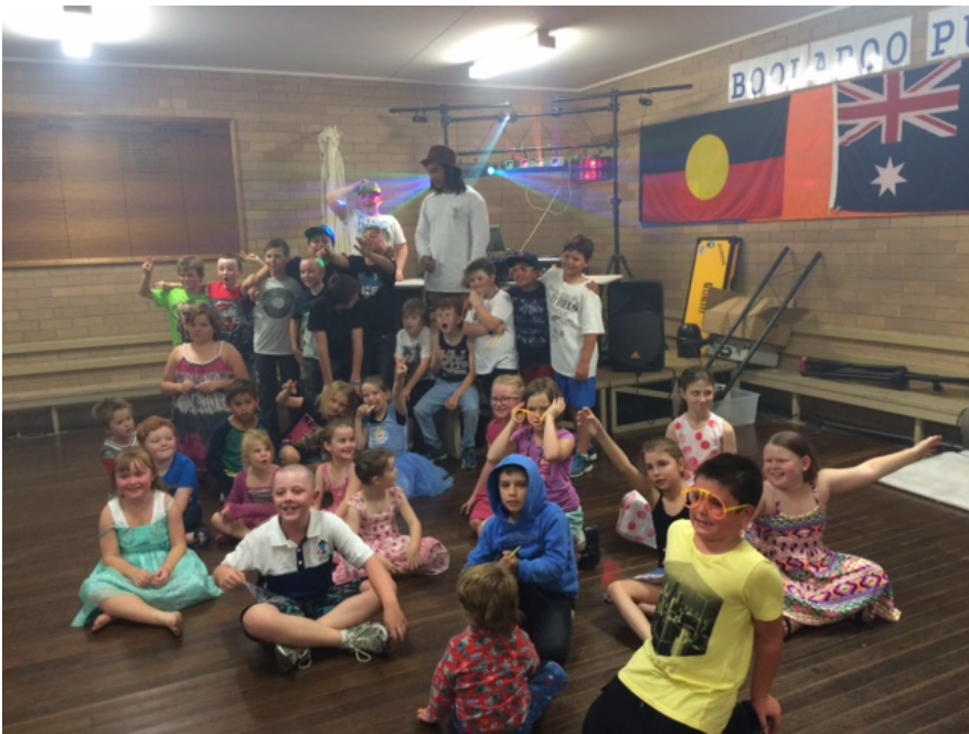
Above: Students enjoying the P&C's End of Term 3 Disco.