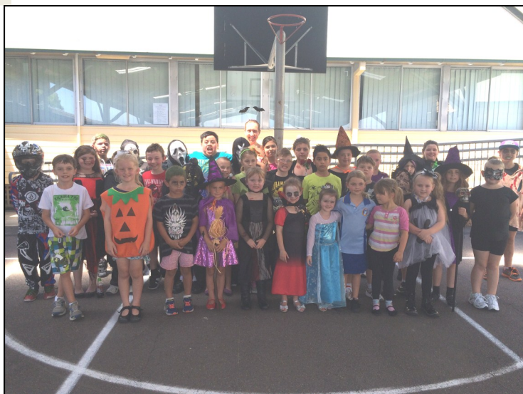
Year 6 Fundraiser — Halloween

Students having fun and looking the part at our recent Year 6 fundraiser.