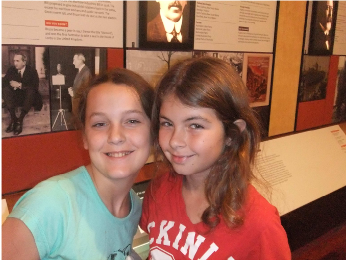
At Old Parliament House