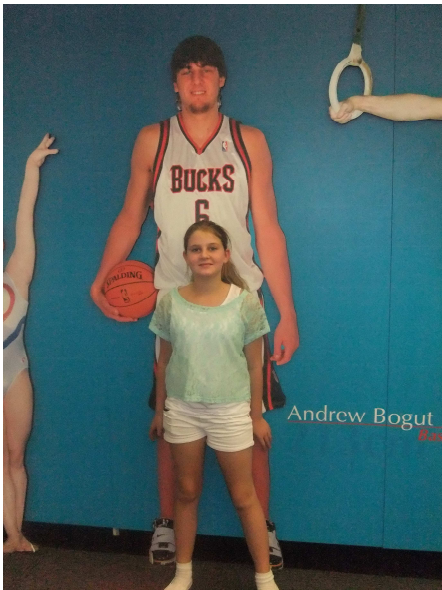
The Institute of Sport