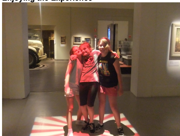
At the War Memorial