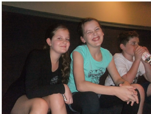
Enjoying the Experience