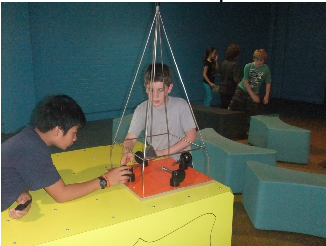
Experimenting at Questacon